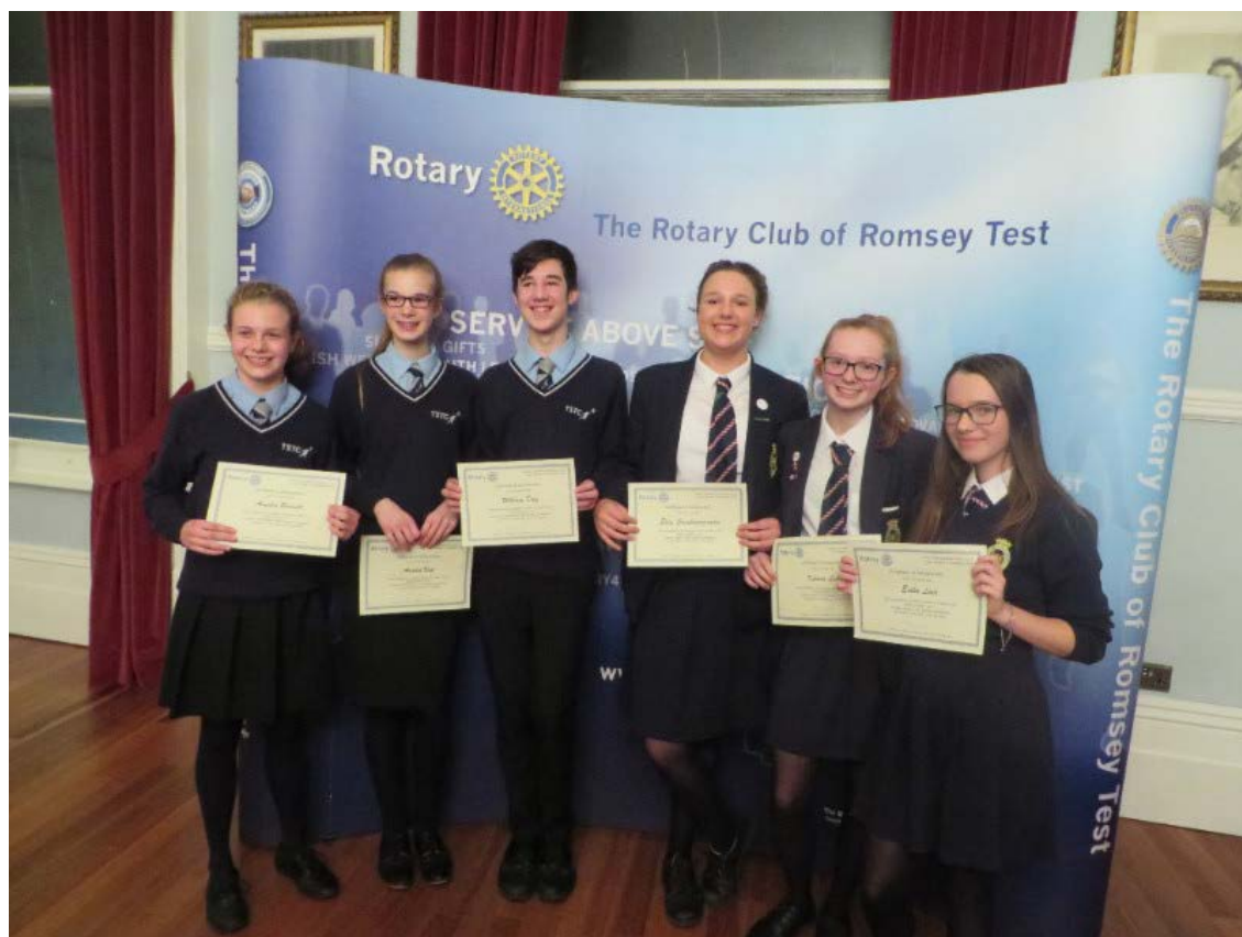
The winning teams with their certificates from the local Youth Speaks heats in Romsey.

Service above Self ---- Service above Self ---- Service above Self ---- Service above Self