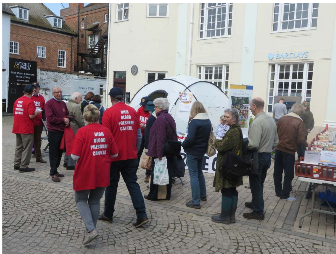
Shoppers waiting to have their blood pressure measured in a Shelterbox tent . (Such as we send overseas to provide shelter when disasters strike)

T ime to call 999 if you see any single one of these signs of a stroke.